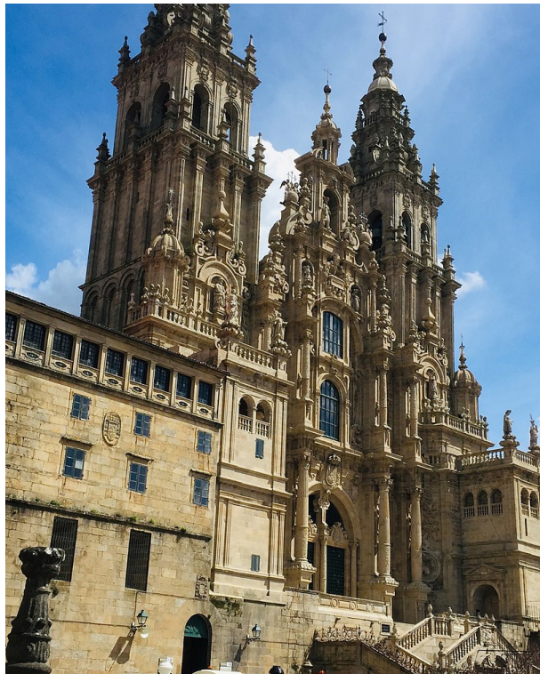
Camino de Santiago de Compostella